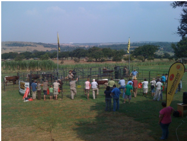
New members taking part in Stockman's Day on the farm.

Even though the Pinzgauer is a Dual Purpose breed, here in South Africa it is mainly bred for beef. Pinzgauers are highly fertile . Heifers are early maturing and calve at an early age, mostly before they are 30 months old. Obviously, the most important economic factor in any breeding program is reproduction . When it comes to male fertility, Pinzgauers possess the two most important qualities in a breeding bull: high sperm count and libido . Pinzgauers are well known for their longevity . Bulls continue to breed up to 11 to 12 years of age. Their strong legs and hard dark hooves carry them through many successful working seasons. Cows however, breed up to the age of 16 to 18 years, but cows breeding up to 21 years of age are no exception. Pinzgauer breeders participate regularly in Phases C and D testing at the National Beef Cattle Performance Testing Scheme (NBCPTS) in the selection of suitable breeding stock for future generations. Bulls perform in the higher categories at the central performance testing stations and always gain in the region of 1900g or more per day, while maintaining a feed conversion ratio (FCR) of 5:1 and better. In the 2006 testing period the Pinzgauers rated the best out of 21 breeds tested with an average ADG of 2.012 and FCR of 5.37 with a final weight of 499kg.